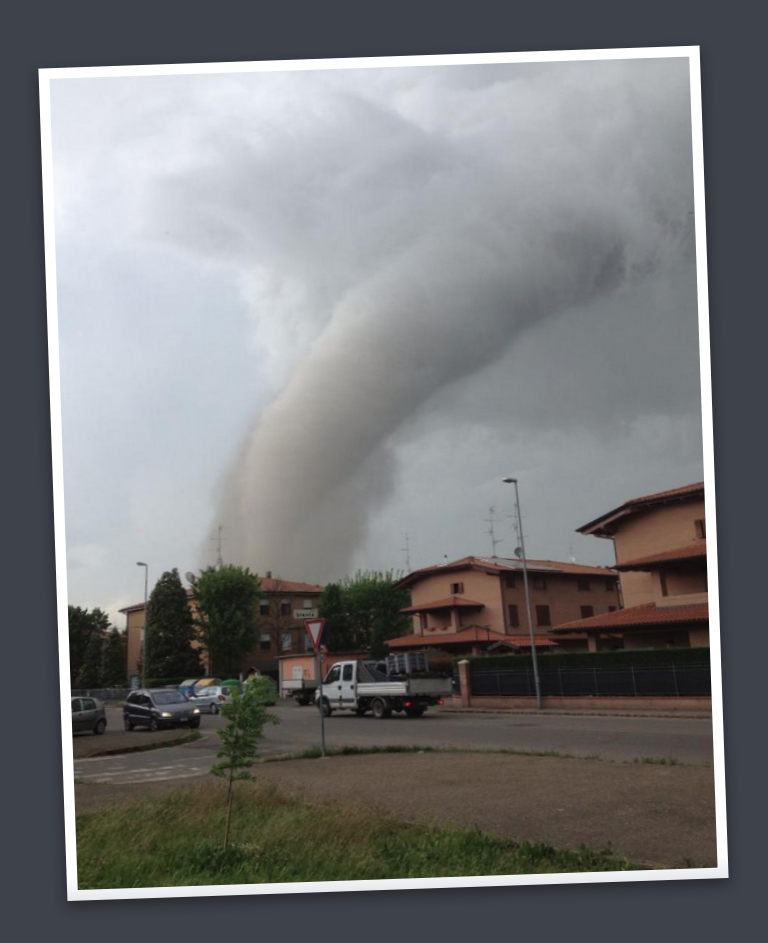
"Some people are weather wise... but most are other wise..." -Benjamin Franklin